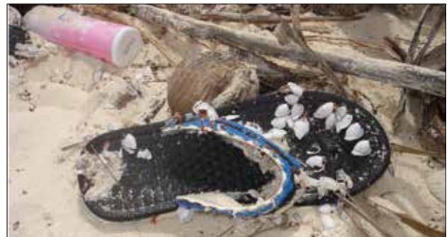
Fig. 3. View of barnacles settled on a beach litter

Plastic litter comprising mostly beverage and cosmetic bottles from South-east Asian countries has been reported accumulating along the shores of Great Nicobar by currents via the Malacca Strait, posing a threat to its rich and unique ecosystem (Darani et al. , 2003; Sahu and Balakrishnan, 2019). Darani et al. (2003) had already quantified the share of plastic litter being swept in to the shores of Great Nicobar Island from Malaysia (40.5%), Indonesia (23.9%), Thailand (16.3%) and Singapore (7.4%). Similar to the Great Nicobar Island in the Andaman Nicobar archipelago, Minicoy Island, which is the southern most island and so proximate to Maldives Ridge has the highest deposition