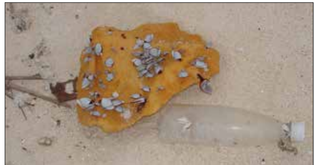
Fig. 4. View of drifted piece of litter found in the shores of Minicoy Island